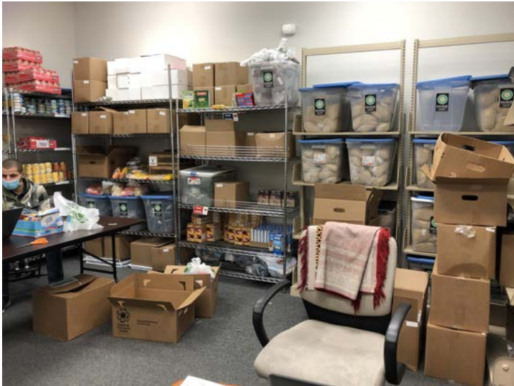
Clockwise: Stocking the INCA Pantry, Delivering Care Boxes, A filled INCA Pantry!