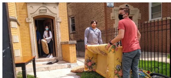
Bridge Builders with BPB mentored and sponsored families