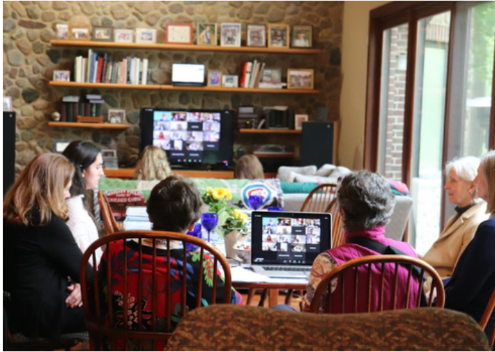
Bridge Builders at first hybrid Learning Luncheon