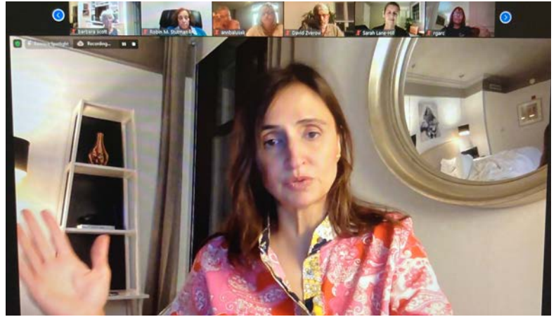
Roya Hakakian discussing A Beginner's Guide to America: For the Immigrant and the Curious with BPB Bridge Builders