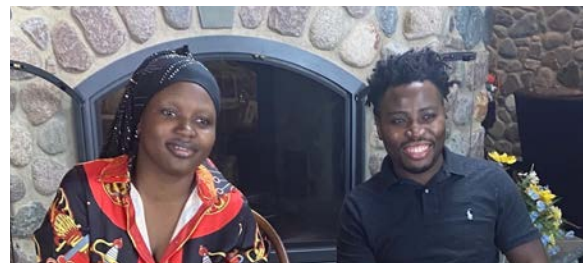
Bridge Builders with BPB mentored and sponsored families