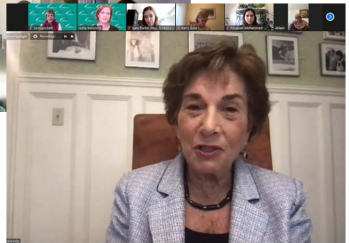
Congresswoman Jan Schakowsky leading a discussion about new immigrants.

Watch the discussion on Vimeo: https://vimeo.com/602100323