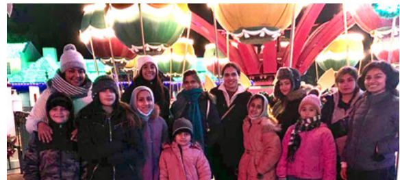
Bridge Builders with BPB mentored and sponsored families