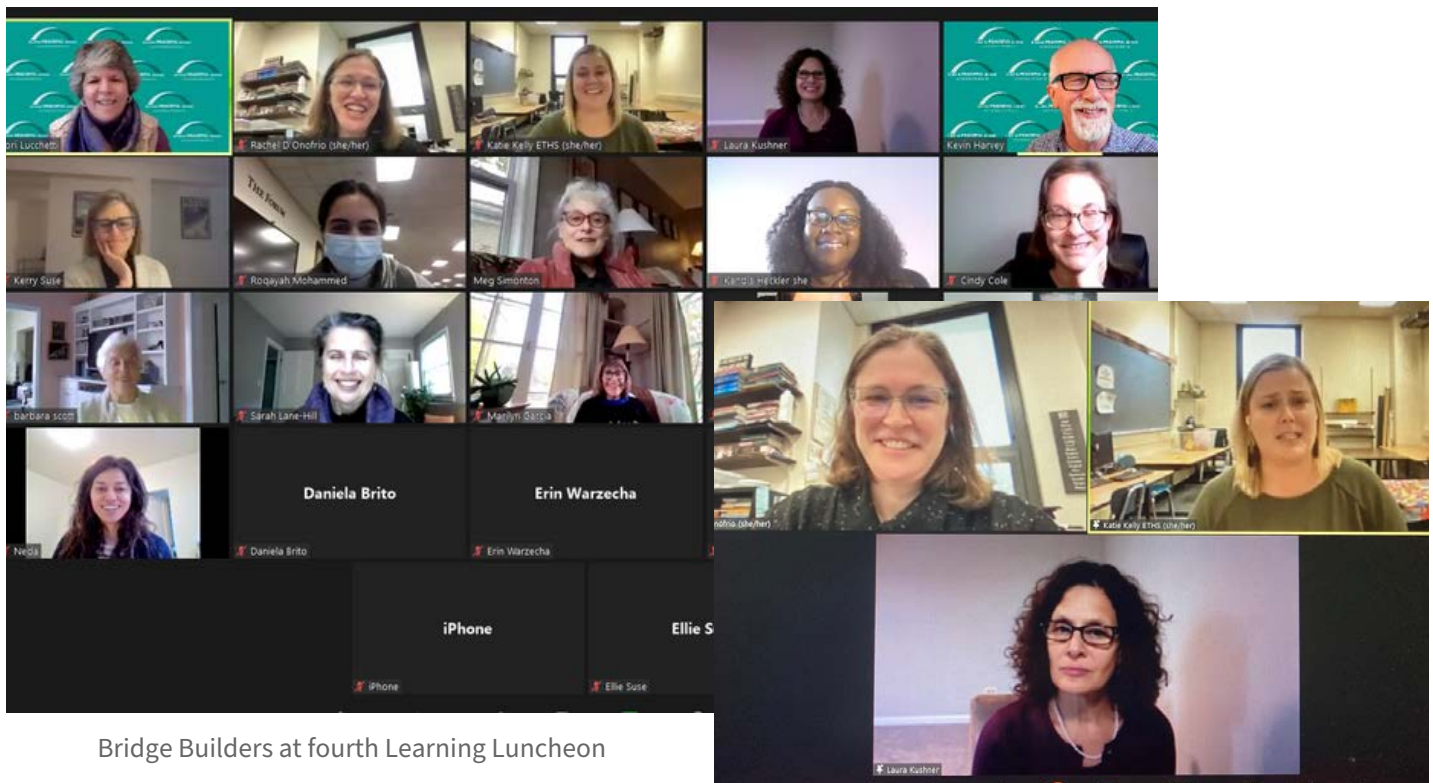
Bridge Builders at fourth Learning Luncheon