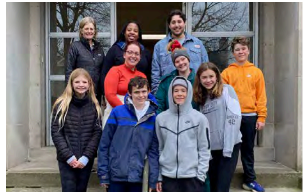
BPB volunteers with 8th graders from Saints JFX