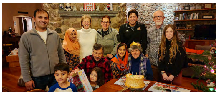
Hadya's Student of the Month Celebration